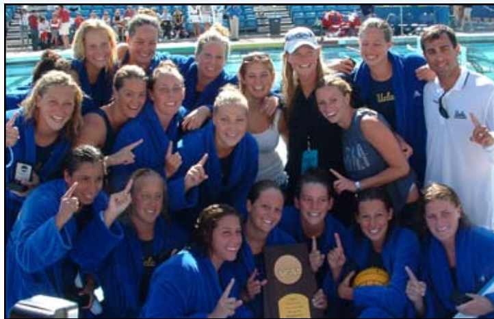
2003 NCAA CHAMPIONS