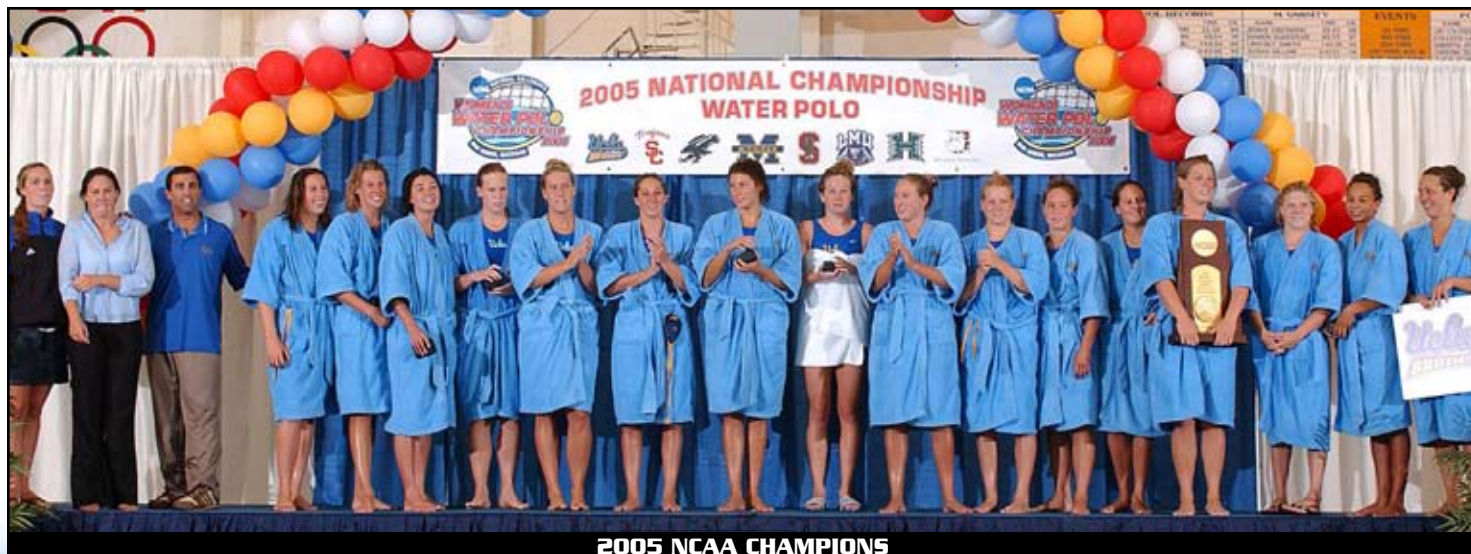
2005 NCAA CHAMPIONS